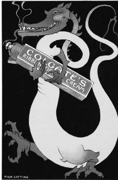
Hugh Lofting, Zingo and the Magic Beans. Jersey City: Colgate Company, 1926 ($125).